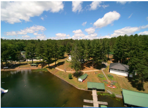
Camp Turk on Round Lake in Woodgate.

After the tour they travelled north to Woodgate and Camp Turk. They settled into their