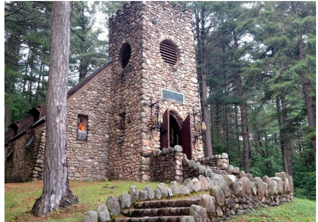
Sarah Hill Wiley Memorial

accommodations and tour the grounds, including the Sarah Hill Wiley Memorial.